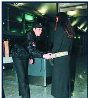
U.S. & International Airports